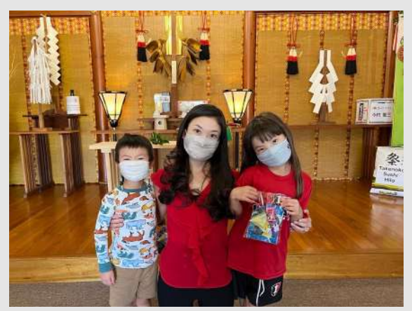
An annual Family Blessing was performed for these shrine friends on September 29.