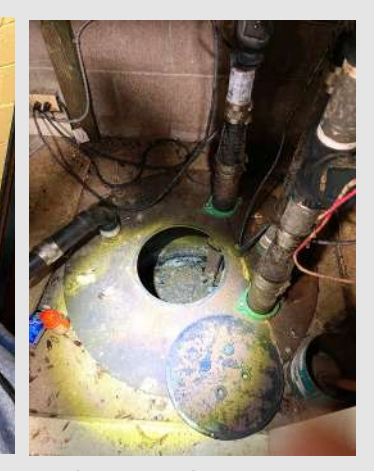
Underground Sump pump

Plumbing issues plague old buildings and the shrine has been experiencing its share of issues.