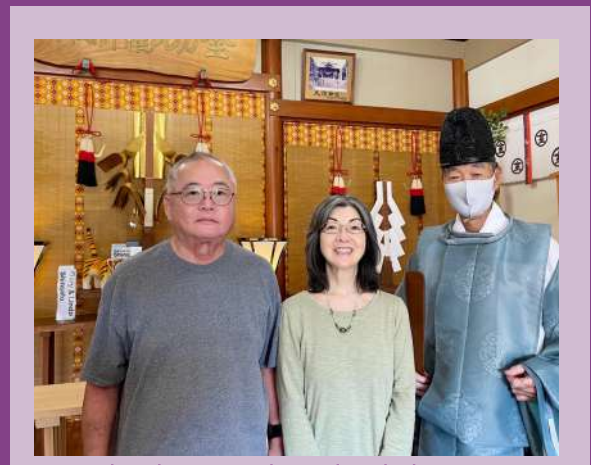
May this be your best birthday yet!