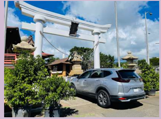
A Car Blessing was performed on 11/14