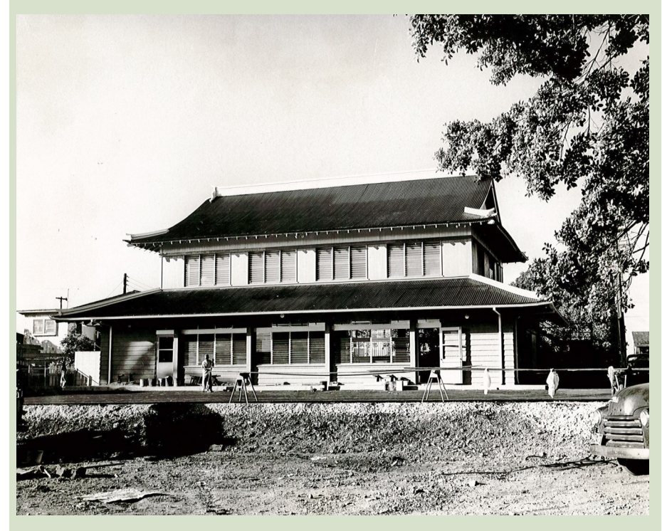
Relocation of the Hall building was completed on September 13, 1962.

Mochi was thrown to members at the opening of the new hall that was relocated from it's original site on H-1, near Queen Liliuokalani Children's Center. The above photo was taken on September 26, 1962