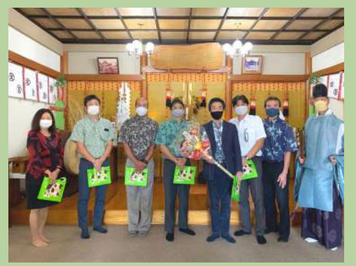
A blessing was conducted for JAL for continued success as it spreads its wings and soars to new heights