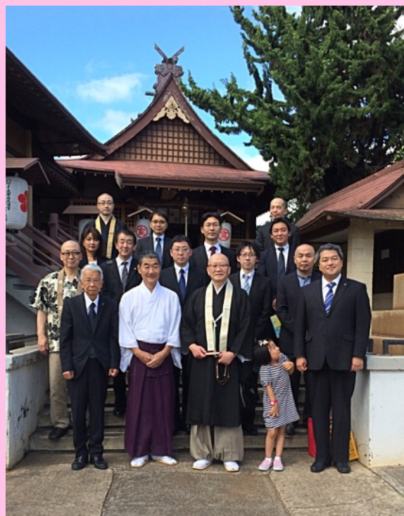
Religious leaders from the Japan Religious 21st Century Committee visited the shrine on Sunday, 12/6.