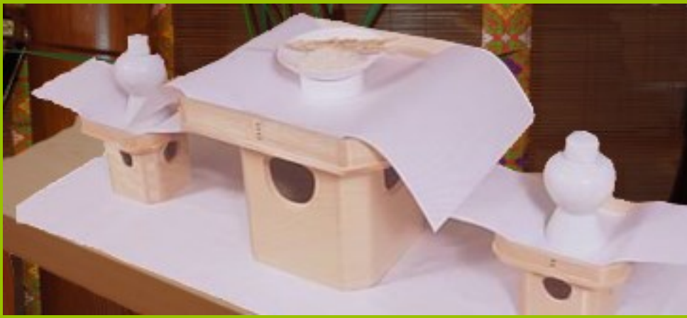
Rice that was cultivated at the shrine was offered along with sake

In the old lunar calendar, the very first day of a month, when there was no moon, is called SAKU 朔 or tsuitachi . The first day of the eighths month is hachigatsu sakuhi 八月朔日, which was eventually shortened to Hassaku.